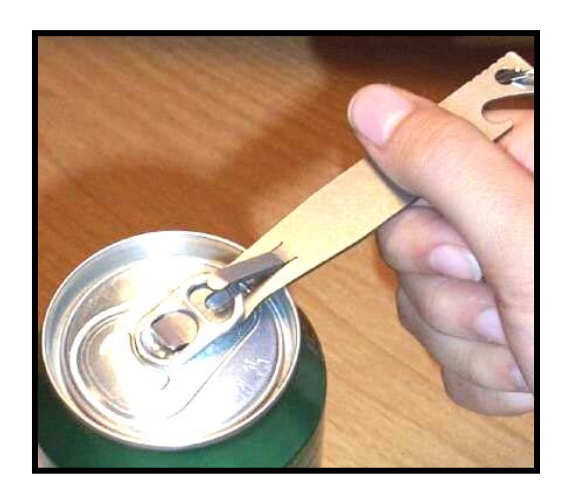
THE EZ-POP is designed for people who have arthritic fingers-or who just want to save their fingernails

It was difficult for her to open soda cans, and she figured she wasn't alone. Her idea impressed her